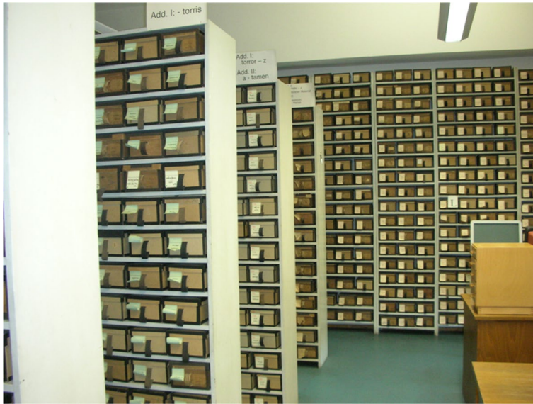
Fig. 1 ‘SSA Time took up a great deal of space.’ Archive of slip-boxes, each of which contains hundreds of example citations, at the Thesaurus linguae Latinae, Munich.

never forget, that he is collecting for the CIL . He who wishes to research a district so thoroughly that he himself visits every little place where there is even the prospect of old inscriptions, [so thoroughly] that he stays in every old place until he himself has seen all the stones that tend to be strewn for several miles in the vicinity, does good and useful work ... . But for a CIL one cannot travel that way, for the simple reason even that then ten years would not be enough to travel through Italy; the CIL should not go out after inscriptions in places that are to this point epigraphically uncharted, and certainly not make travels aimed at discovery, but only collect, sift, check that which is already found and generally known. 39